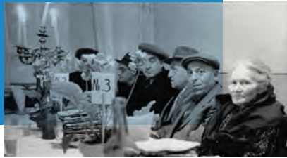
Assembled for a Passover meal. Poland, 1960s.

In 2022, Polish Jewry played a heroic role in welcoming Ukrainian refugees, with Jewish Community Centers and JDC staff in Warsaw and Krakow leading the communal response. A building that once housed a yeshiva, a Jewish learning institution, in Lublin—only to be occupied by the Nazis and then taken over by the Communists—became a safe haven for refugees, thus representing the travails and rebirth of this essential Jewish community.