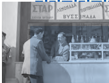
A Jewish survivor in his shop. Greece, 1949.

Before World War II, the city of Thessaloniki was once almost 50 percent Jewish, with the ports closed for Shabbat. Salonika was a center of Sephardic culture and they spoke Ladino, (Judeo-Spanish) the main language of the Jews. Though Greek Jewry was almost destroyed by the Nazis during World War II, a