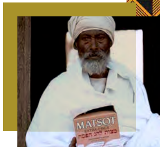
An Ethiopian Kess (Jewish religious leader) holding a box of matzah delivered by JDC. Ethiopia, 1988.

With the dawn of communism in the 1970s, this ancient Jewish community found itself under threat. As famines and civil wars increased across Ethiopia over the next two decades, the situation became dire. After the