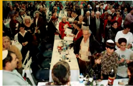
Seder at Buenos Aires JCC. Argentina, 2003.

Jewish Community Centers, schools, synagogues and other cultural institutions that host dynamic Jewish life. Rabbinical students study at Reform and Conservative movement schools and go on to serve communities throughout Latin America.