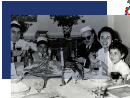
A family Seder in a home in Morocco. Casablanca, Morocco 1960.

partnership between Moroccan Muslims and Jews, has worked to preserve the history of ancient Moroccan Jewish life and celebrate the substantial Jewish contribution to this nation.