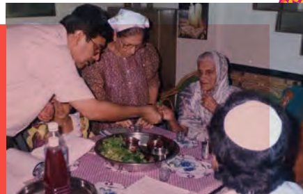
Passover Seder in a home for the aged. India, 1997.

community. Every year, a cohort of Indian Jews attends Szarvas, JDC's international Jewish summer camp in Hungary, building bridges with global Jewry.