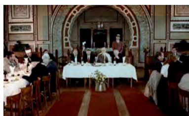
Interfaith Seder. Sarajevo, Bosnia and Herzegovina, 1995.

Today, Sarajevo's Jews continue to live harmoniously with their neighbors in a multicultural, multilingual city that has a church, mosque, and synagogue within walking distance of the city center.